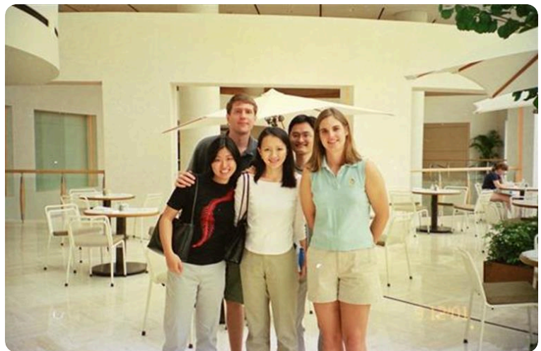
Visiting Singapore, 2001