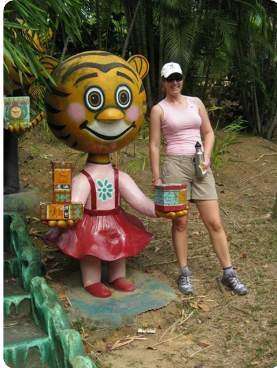
Haw Par Villa, Singapore 2009