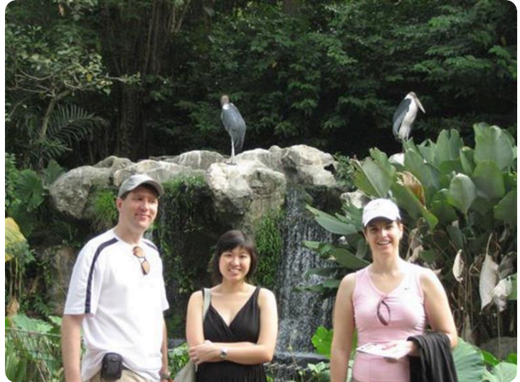
Jurong Bird Park, Singapore 2009