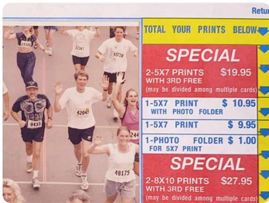
Bay to Breakers