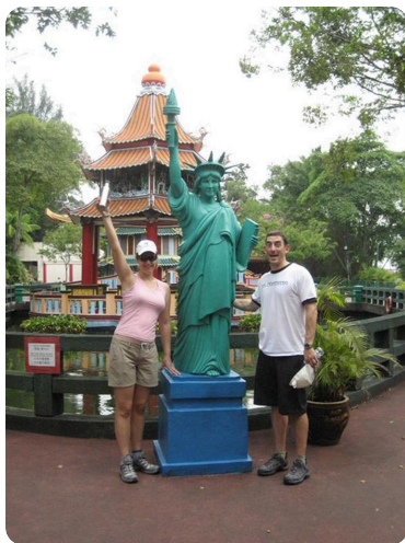
Haw Par Villa, Singapore 2009